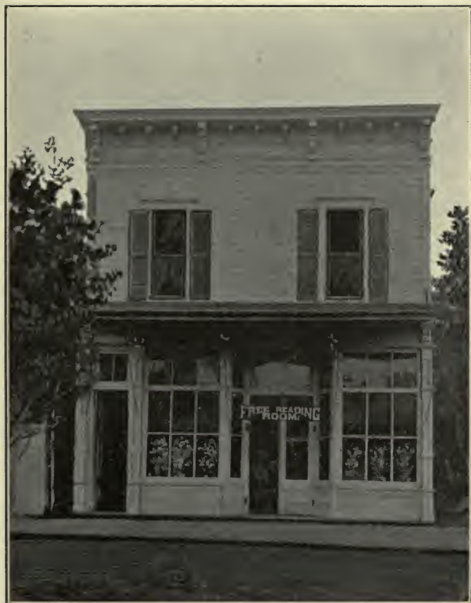
CORVALLIS W. C. T. U. HEADQUARTERS, First Headquarters Built by a Local Union on the Coast.